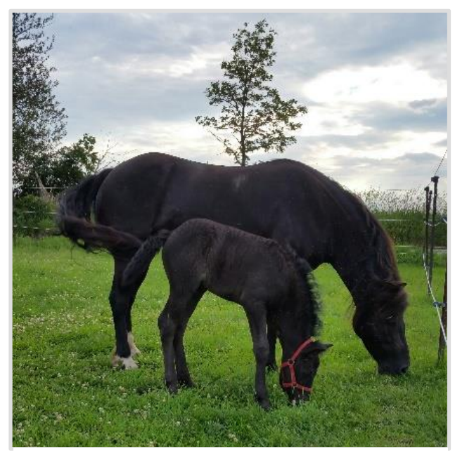
Y-Ette and her foal Exel

I have owned 16 Canadians over the past 17 years and have put seven on the ground. I bred slowly and systematically. I