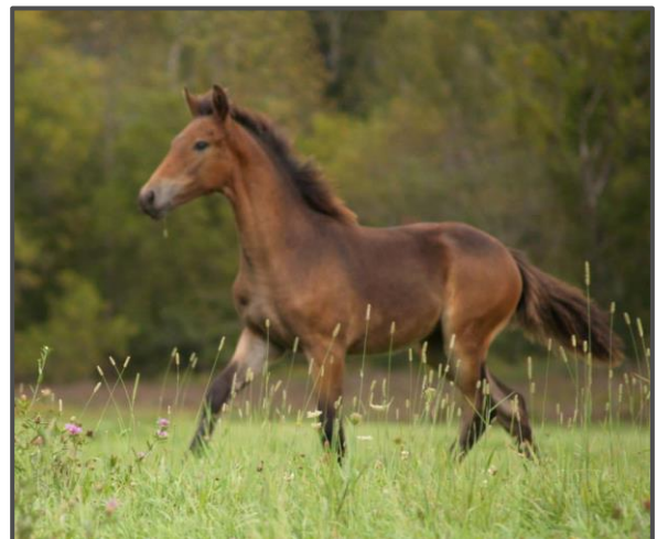
Bestyme as a young filly