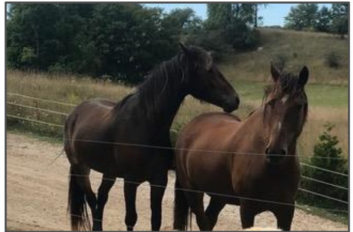
Astérix & Bestvme

before. Watching them express their joy on turn-out lifts the heart and starts the day right. How could we miss that?