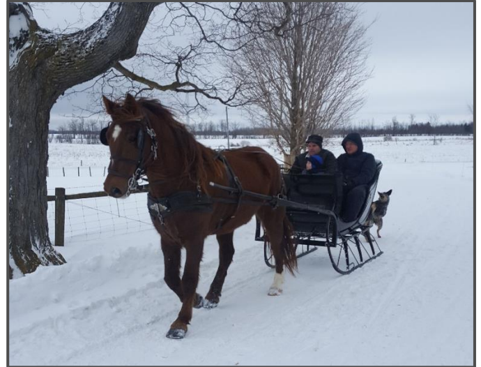
Astérix pulling a sleigh