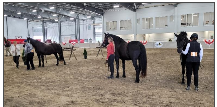
Halter Class 3 Years and older