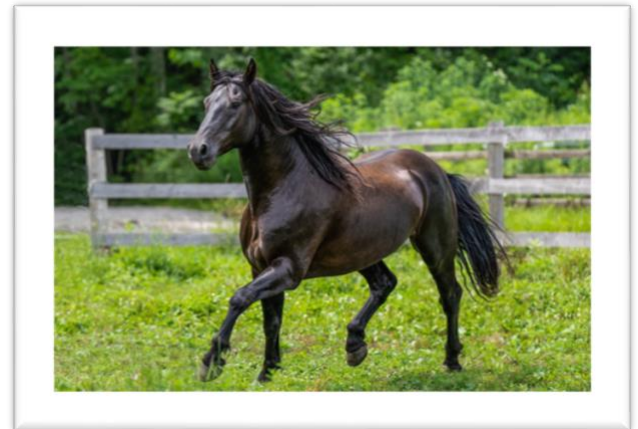
Canadream Kelbeck Ébène, owned by Samantha Rentner, Snowy River Canadians, Coldwater, ON

The Canadian quickly became my favourite breed, and I visited 13 Canadian horse farms in 2024. Why? Big brave heart, more athletic than a warmblood, calmer than a sport horse, faster learning than a hot blood, and more beautiful than any breed I have ever met. I find the Canadian friendlier than any breed I have photographed, and the foals are just a joy to be around.